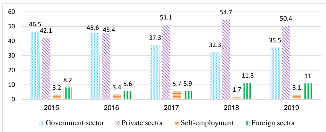
Figure 3. Statistics on the employment rate of graduates based on work sectors