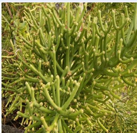
Figure 2: Euphorbia tirucalli L.

deposited in the herbarium of the Department of Organic Chemistry, Faculty of Chemistry, Ho Chi Minh University of Education.